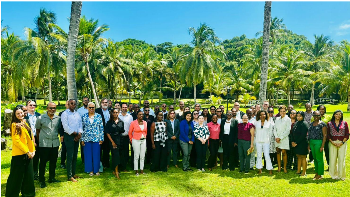
Figure 1 RCC Caribbean Workshop on Advancing NDCs 3.0 participants

The training was attended by representatives from The Bahamas, Cuba, Dominica, Dominican Republic, Grenada, Guyana, Haiti, Jamaica, St. Kitts and Nevis, Saint Lucia, St. Vincent and the Grenadines and Trinidad and Tobago in addition to several agencies supporting various aspects of NDC implementation including the Caribbean Cooperative MRV Hub, GIZ (Deutsche Gesellschaft für Internationale Zusammenarbeit), UNDP (United Nations Development Programme), OECS Commission (Organization of Eastern Caribbean States), IDB (Inter-American Development Bank), CCSA (Caribbean Community Climate Change Centre), FAO (Food and Agriculture Organization), UWI (University of the West Indies), CBIT-GSP (Capacity Building Initiative for Transparency - Global Support Program), ICAT (Initiative for Climate Action Transparency) among others.